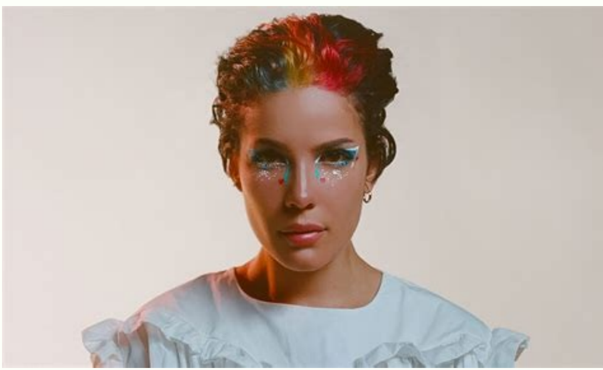
Beyonce crazy in love music video